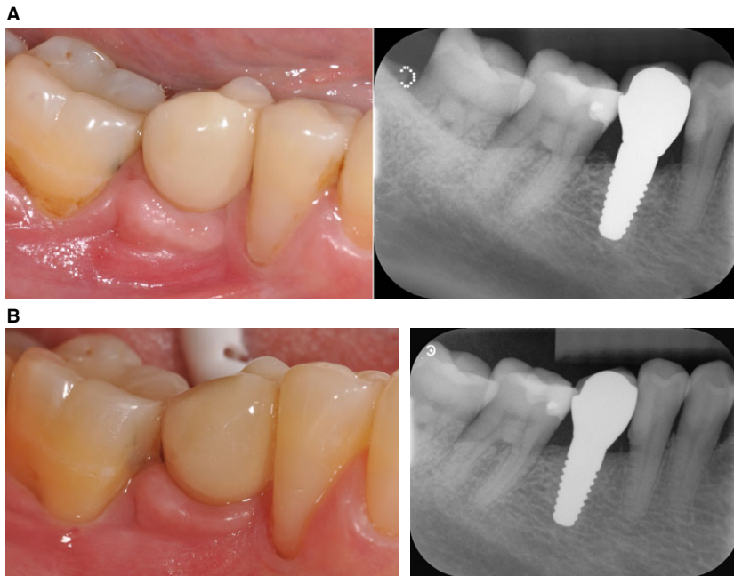
Fig. 2. (A) Clinical photograph (left image) and radiograph (right image), 1 year after loading (two-piece zirconia implant). (B) Clinical photograph (left image) and radiograph (right image), 4 years after loading (two-piece zirconia implant).

included. Fourteen papers were analyzed, including three randomized clinical trials, whereas 11 were case series with varying designs (Table 1). The meta-analysis was limited to survival of implants at 1 year as a result of the short-term observation period in most studies. The overall survival rate of zirconia one- and two-piece implants was 92% (95% CI: 87–95) after 1 year of function. Furthermore, the prevalence of zirconia implant failure was examined (Table 2). Early failure of one-piece zirconia implants ranged between 1.8% and 100%, with the overall early failure rate calculated at 77% (95% CI: 56–90). Meta-analysis could not be performed on the failure rate of two-piece implants as only two studies clearly reported failure rates. Cionca et al. (20) reported an overall failure rate of 12.2% with only one early failure (2%) and five (10.2%) late failures. Payer et al. (73) showed a 6.3% failure rate with only one implant failing after loading. On the other hand, Brüll et al. (13) only reported failure of three implants without details on the implant design (one- or two-piece).